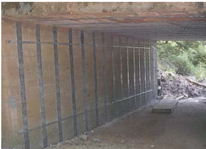
The abutment and deck of this bridge in Phelps County, Missouri, was strengthened using SAFSTRIP®.