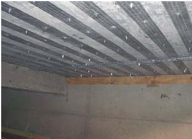
This bridge, located in St. James, Missouri, was load posted at the time of strengthening. After mechanically attaching SAFSTRIP® with concrete wedge bolts and anchors, the bridge load limit was raised to 20 tons.