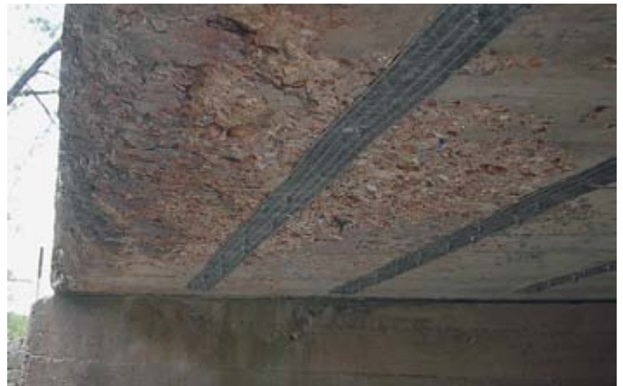
As a result of a SAFSTRIP® retrofit, the existing 12-ton load posting for this bridge in Phelps County, Missouri, was removed.

3 Modulus design values are not reduced in accordance with ACI 440.2R-02