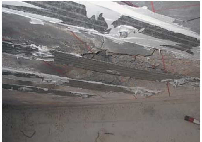
Severe deterioration prevented the application of a bonded strengthening system to this bridge in Pulaski County, Missouri, but MF-FRP applied SAFSTRIP® was able to repair the bridge.