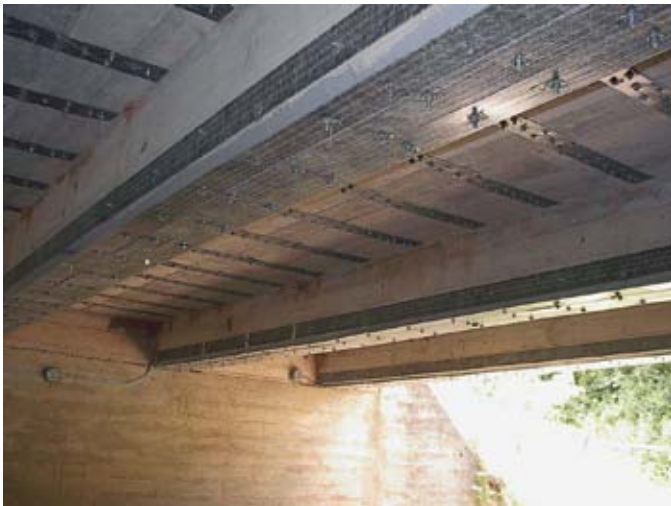
The posted load for this bridge that spans the Meramec River in Missouri was increased from 10 tons to 18 tons by installing SAFSTRIP® using the MF-FRP system.